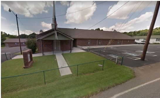
(the church building prior to the fire)

Roe Junction is over 100 years old. On March 29, 2020 lightning struck the steeple and the sanctuary built in 1999 was destroyed by fire. Services are now being held in the fellowship hall in the back part and makeshift Sunday school classes in the front area. The process of rebuilding began in March 2021 with Wild Construction overseeing the construction project. Builders for Christ begins their work in June 2021 with teams throughout the summer to help this church rebuild.